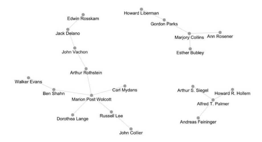
Fig. 4 A network of the twenty staff photographers with the largest set of credited photographs from the FSA–OWI archive. Each photographer was connected to the photographer whose photos most resembled their own using the distant metric induced by the penultimate layers of the InceptionV3 neural network model (Szegedy et al. , 2015)