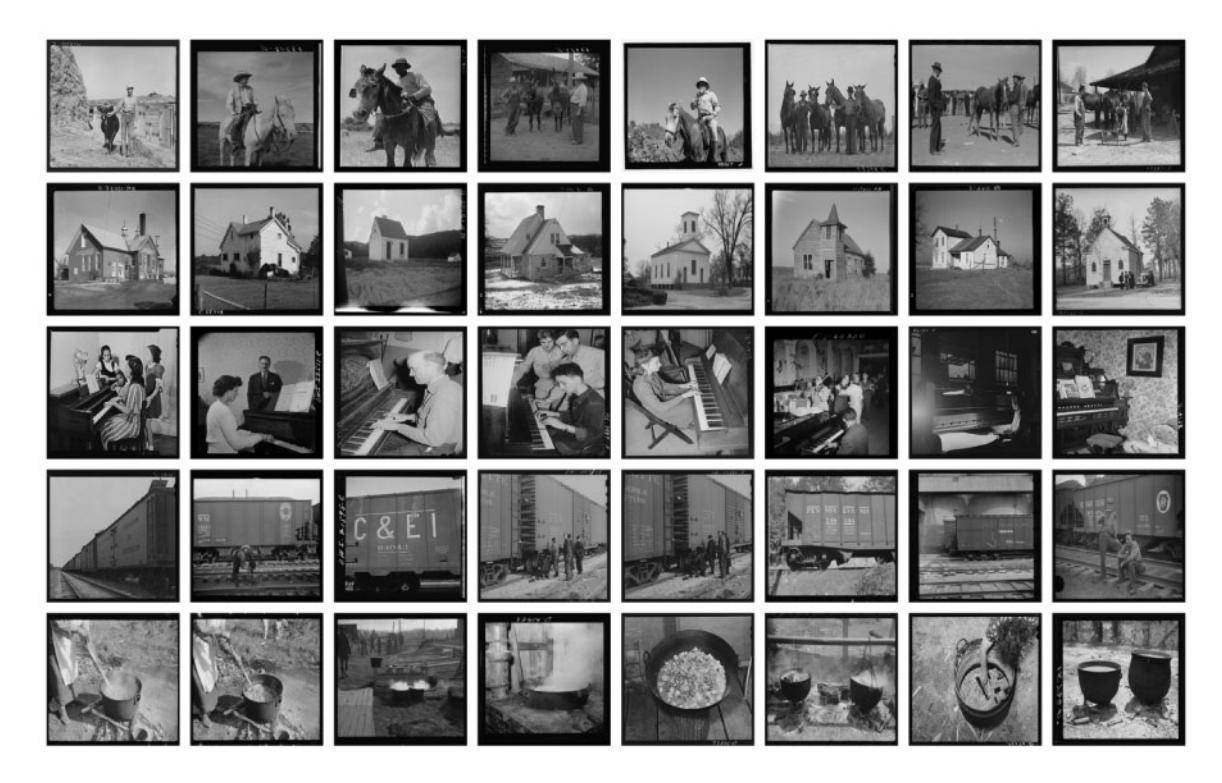
Fig. 3 The left column of this grid of photographs shows images selected from the FSA–OWI archive, a collection of documentary photography taken by the United States Government between 1935 and 1943. To the right of each image are the seven closest other images in the collection using the distant metric induced by the penultimate layers of the InceptionV3 neural network model (Szegedy et al. , 2015). Notice that each row detects images with a similar dominant object: horses, wooden houses, pianos, train cars, and cooking pots