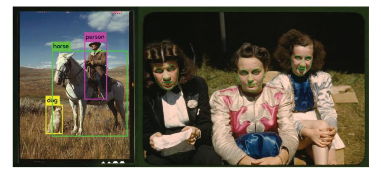
Fig. 1 Detected features in two color photographs from the FSA–OWI archive, a collection of documentary photography taken by the United States Government from 1935 to 1943. The left image shows detected images from the YOLOv4 algorithm (Redmon et al. , 2016): a horse, a person, and a dog. The library can detect 9,000 classes of images. On the right are detected facial features—such as the location of eyes, nose, mouth, and jawline—from the three women as detected by the dlib library (King, 2009)

(Smeulders et al. , 2000, p. 1375). The challenges of interpretation of visual material is further expounded when studying large corpora by applying the process of converting images into a coded system with an automated logic.<sup>6</sup>